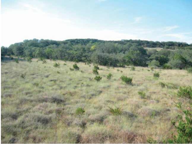
Figure 3. Deep Redlands Ecological Site in State I, illustrating early stages of invasion of junipers into the open grassland in the foreground. Spot treating with herbicide or hand thinning are cost-effective methods of treating this site.

creases, runoff increases, and soil loss may begin to accelerate because of shifts in grass composition from tall and mid species to short grass species, higher percentages of bare ground, soil compaction and capping, loss of organic matter, and deterioration in soil structure (Fig. 2). Hydrologic conditions worsen with continued improper management. When juniper canopy cover is between 10% and 30% (State II.3) and the trees are as tall as 12 feet, average treatment costs rise to $83 per acre (and increase as juniper density and size increases) to return the site to State I. Technical assistance costs triple to $15 per acre because of the complex design and implementation requirements for more intricate management plans. Mechanical brush management, hand thinning, and herbicide use will all be more extensive and expensive than in State I.2. If prescribed fire is not allowed or desired and herbicides are required, costs can be $135 per acre. If there is substantial soil disturbance during mechanical treatments with heavy machinery, rangeland seeding may be needed which can increase the cost to more than $200 acre. Grazing may have to be deferred for up to 2 years to allow for establishment of seeded species or natural regeneration, depending on initial condition of the site and local weather following treatment.