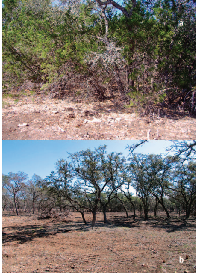
Figure 4. Deep Redlands Ecological Site in State III. a , Dense vegetation, no herbaceous understory, and large, bare spaces that are vulnerable to accelerated erosion. b , A site where mechanical brush control has been used to remove juniper. Notice the lack of understory under undisturbed oaks, brush piles, and soil disturbance from the use of heavy equipment to remove junipers ( b ). This site ( b ) is currently vulnerable to accelerated soil erosion because of extensive bare soil from the brush-control treatment and requires seeding of desired species and rest from grazing until herbaceous vegetation is reestablished to restore to State I.

In State III.4, where Ashe juniper and associated woody species dominate the site (Fig. 2), understory species become increasingly sparse, and ground cover decreases because of